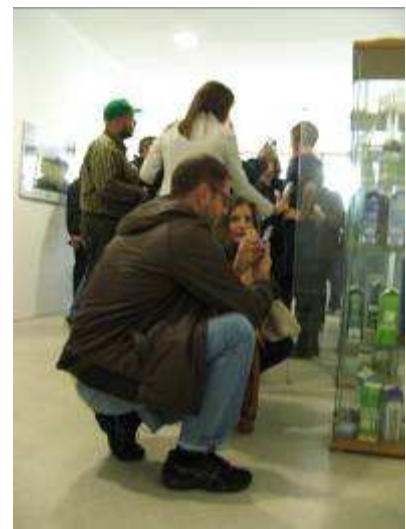
At “Gläserne Molkerei” – organic milk processing factory with the maximum capacity up to 100 tonnes processed milk per day