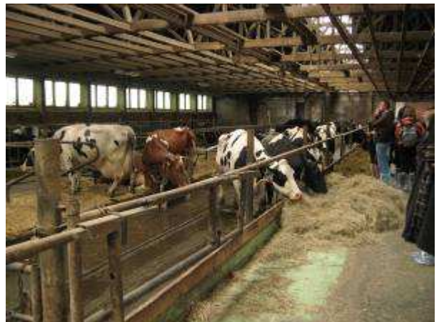
“Agrargenossenschaft Großzöbern” – an organic milk production farm with 330 milking cows and biogas production