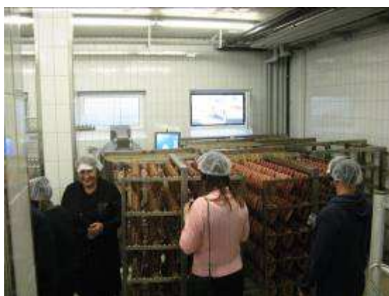
Visit of an organic farm “Fleischerei Vorwerk Podemus” with an organic on-farm slaughter house including a small organic meat processing factory and also an on-farm organic shop

25 participants from Ukraine, Russia, Georgia and Poland took part in the workshop. EkoConnect would like to thank once more the participants for taking part, FiBL for co-organising and Swiss Confederation for supporting the workshop.