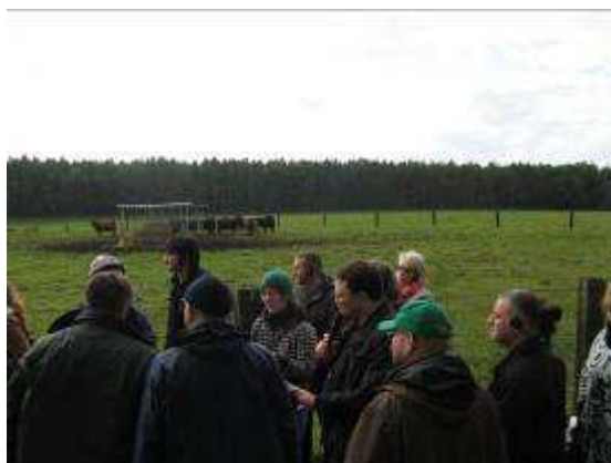
“Biohof Ohler” with organic beef and organic pork production as well as a small slaughter house