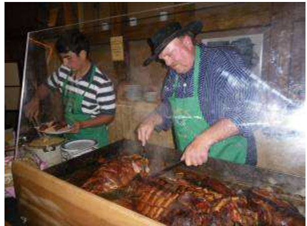
“Backschwein Tenne” – an organic free-range pig farm with an on-farm restaurant