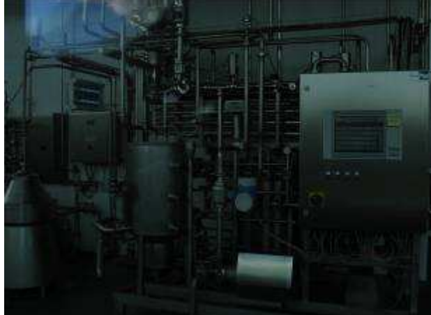
“Brodowin” – an organic farm with about 600 organic cattle, small on-farm milk processing factory processing up to 10 tonnes of organic milk per day as well as an on-farm organic store and restaurant